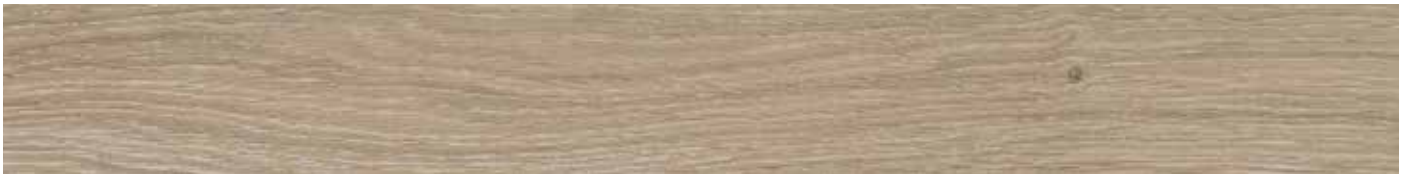
CLASSIC OAK LIGHT BEIGE TID001 / TIC001