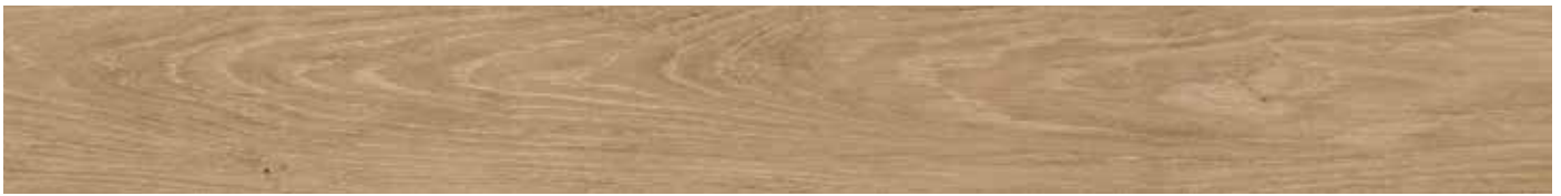
CLASSIC OAK NATURAL TID002 / TIC002