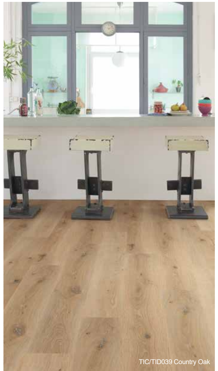
TIC/TID039 Country Oak