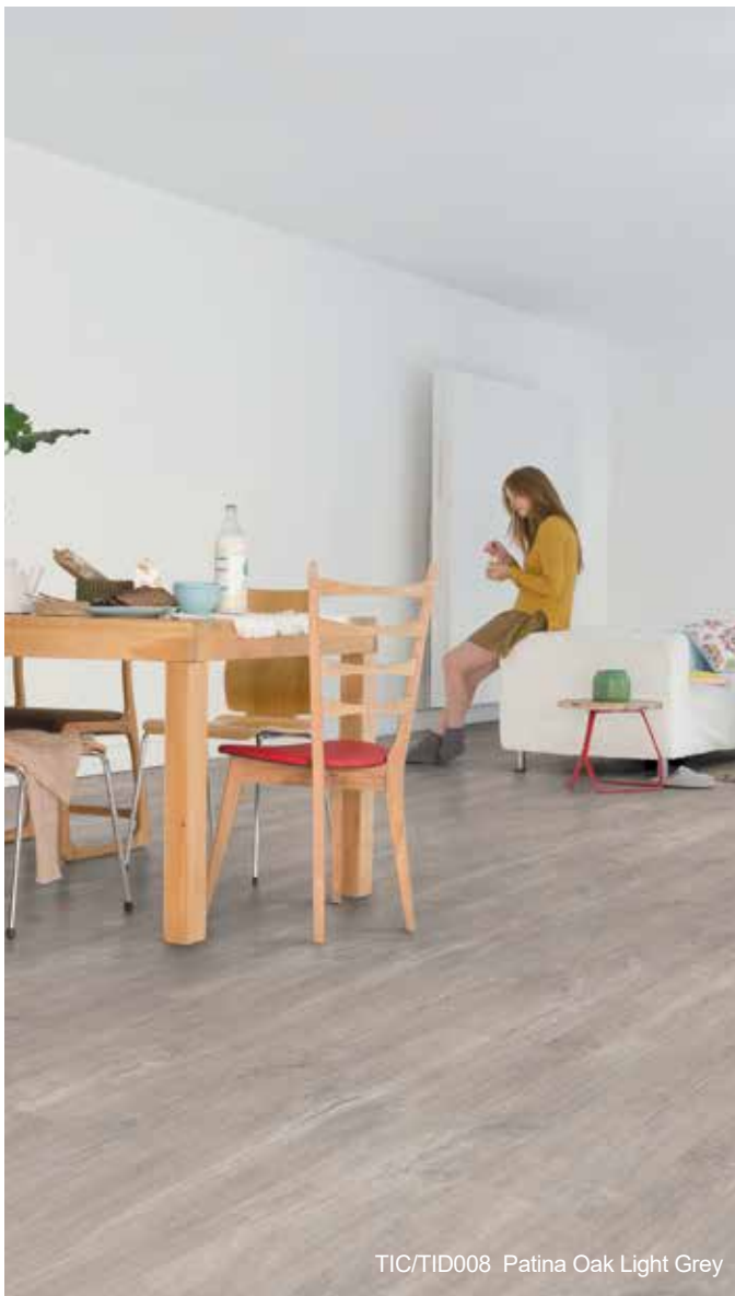
TIC/TID008 Patina Oak Light Grey