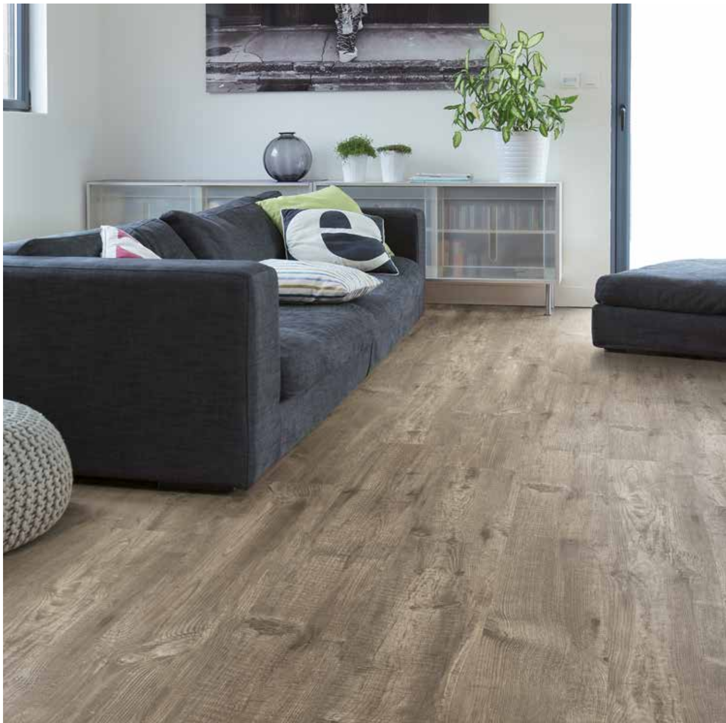
Modern, durable and waterproof vinyl flooring