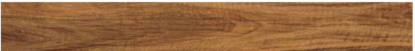
SPOTTED GUM TID036 / TIC036