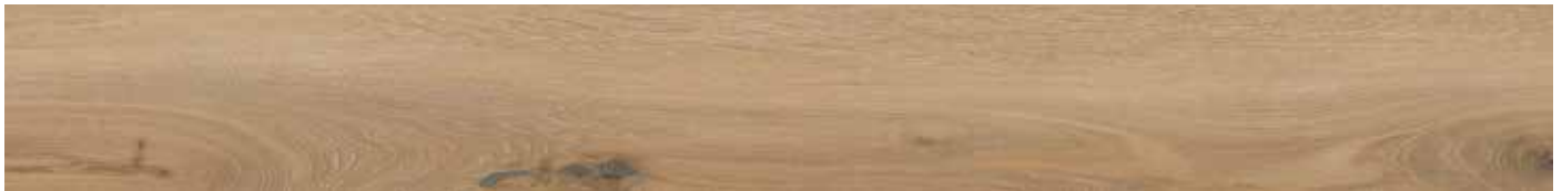
COUNTRY OAK TID039 / TIC039