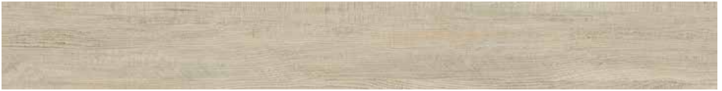
COTTAGE WHITE TID037 / TIC037