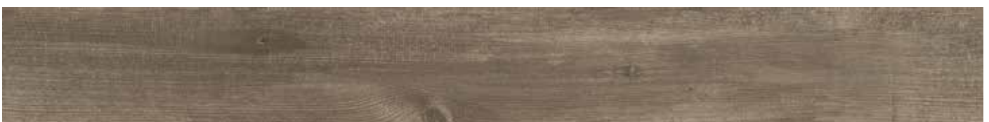
RUSTIC OAK TID038 / TIC038