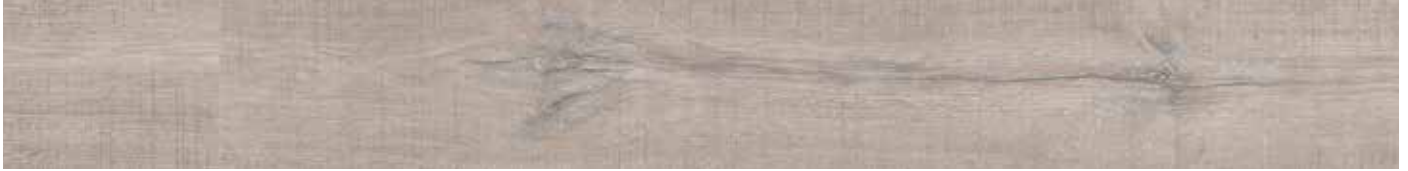
PATINA OAK LIGHT GREY TID008 / TIC008